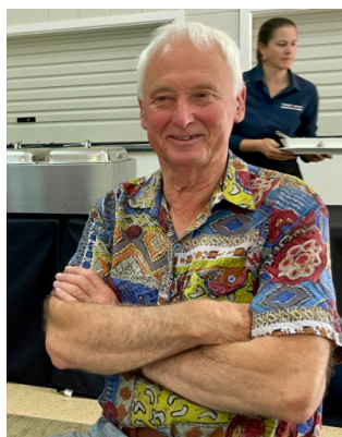
Photo taken at our Christmas function 2025.